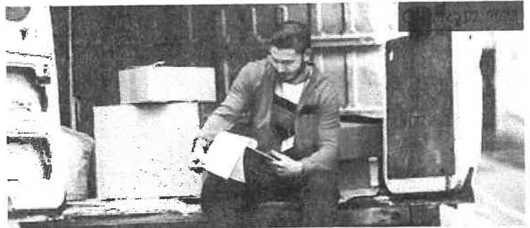
Tips to Improve Your Relationships with Vendors