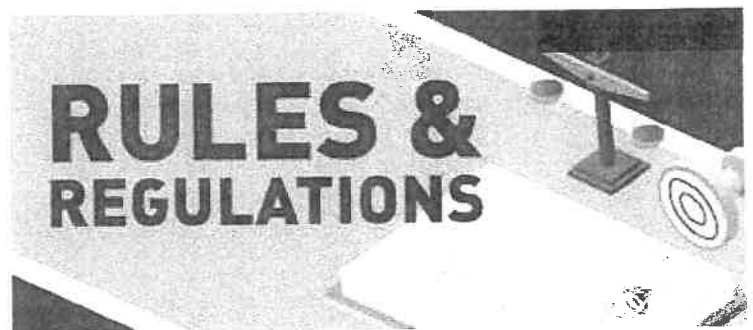
Rules and Regs: Cape Cod Nitrogen Rule Draws Official Opposition