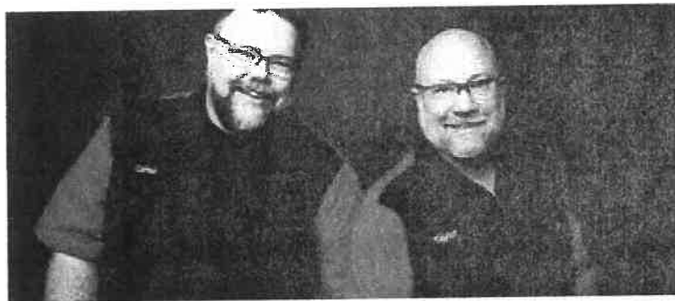
How Being Too Busy Can Be Bad Business