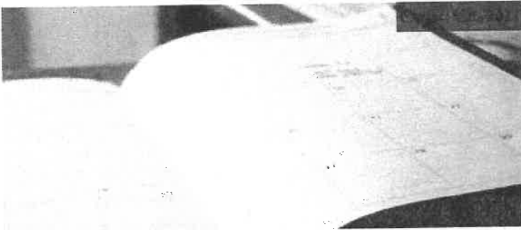
How a Flexible Work Schedule Could Help You Attract Employees