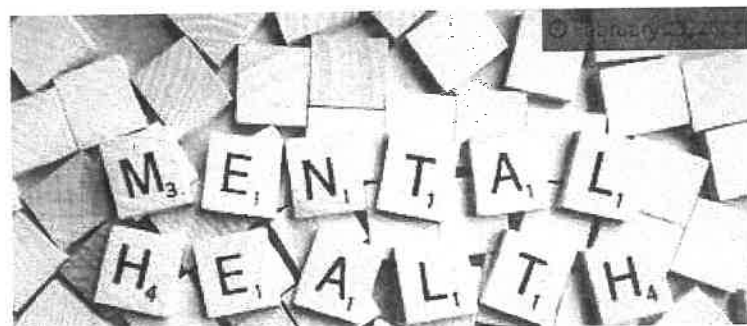
Why Mental Health Is the New Frontier in Job Safety